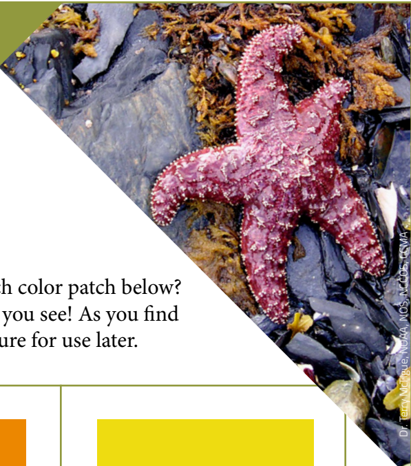
D. Perry McRae, NOAA, NOS, NODS, COWA

Can you find an ocean animal that matches each color patch below? It can be a fish, a snail, a coral, or anything else you see! As you find each one, write down its name and take its picture for use later.